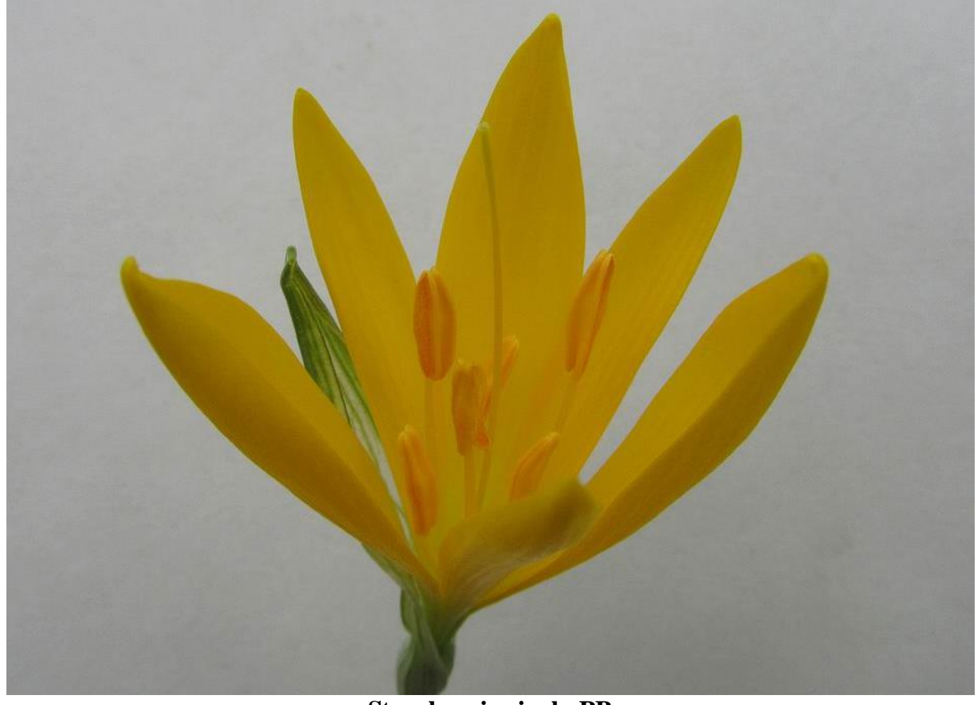
Sternbergia sicula PB

Sternbergia sicula MJ Yet another distinguishing feature are the floral segments especially the outer three are distinctly boat-shaped in the PB form, below, but flatter in the MJ form, above.