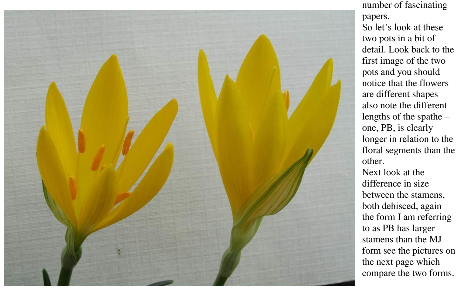
Sternbergia sicula

Any one that has followed the bulb log through 12 years will know that I have big problems with knowing just what Sternbergia sicula is. There seem to be many plants that share this name and I do not understand how they can all be a single species. Botanists have puzzled over this for many years and if you search the internet you will find a