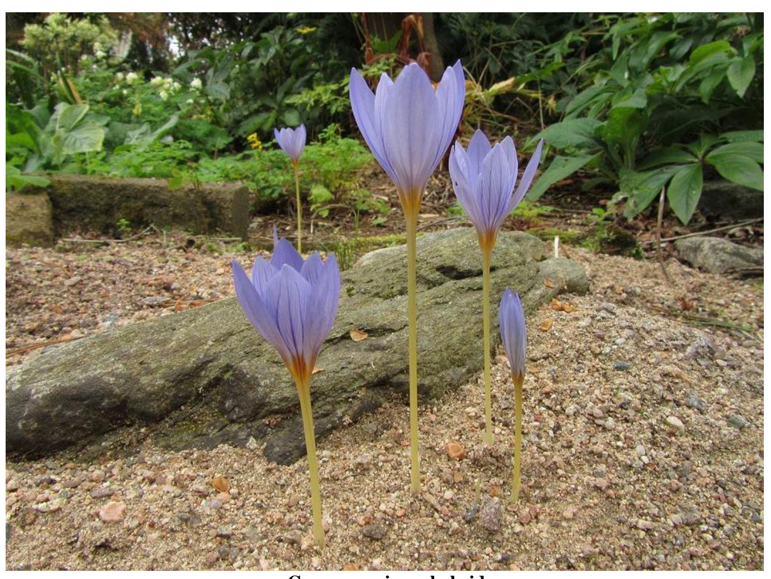
Crocus speciosus hybrid

I am pleased and relived to see so many still flowering in this sand plunge after the number of corms that were eaten by mice last winter.