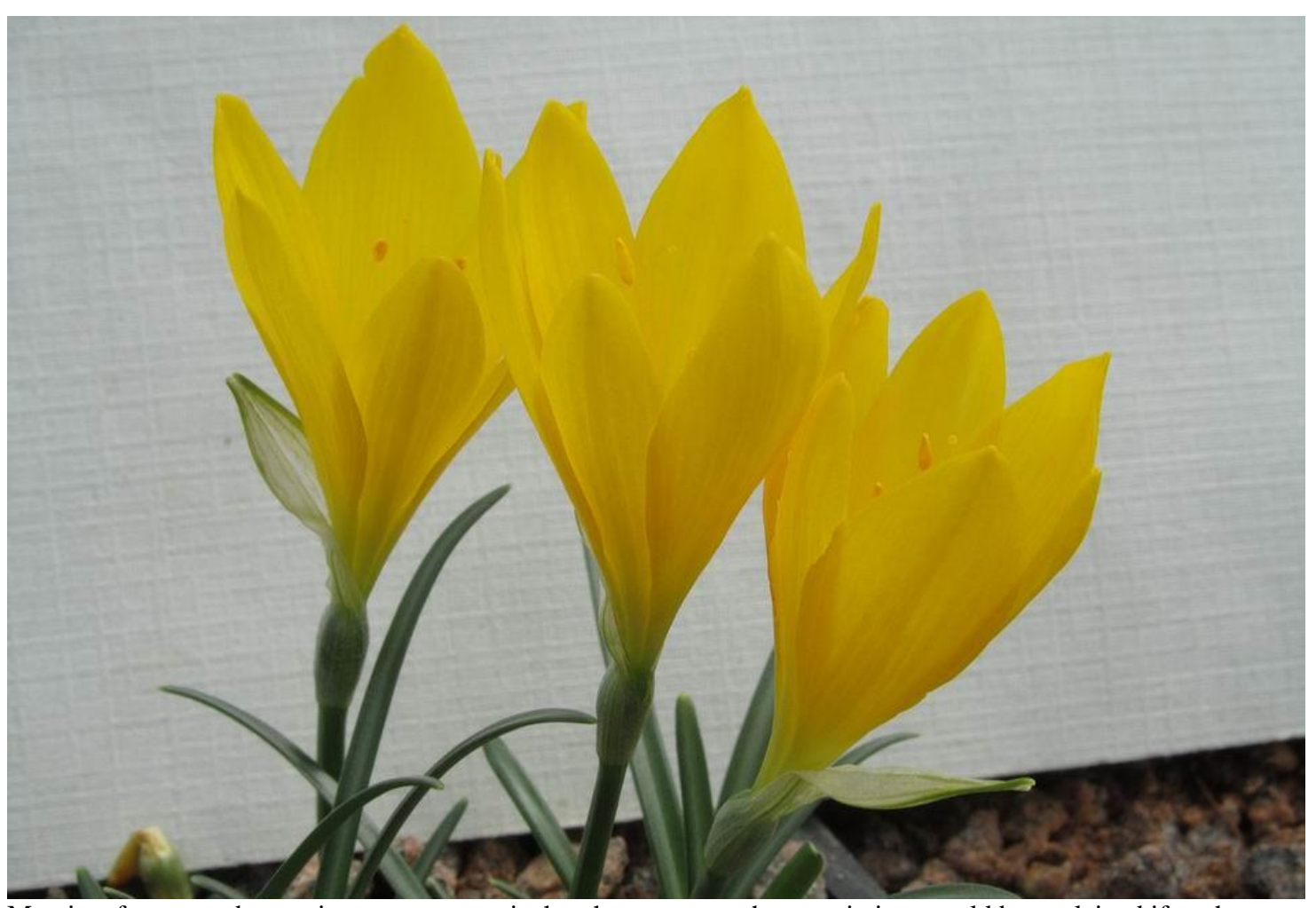
My view from my observations as a grower is that the answer to these variations could be explained if we have Sternbergia lutea as the largest of the yellow autumn Sternbergia and S. greuteriana as the smallest and a swarm of hybrids in between. Whatever these plants are I love them all and am very pleased to be growing them