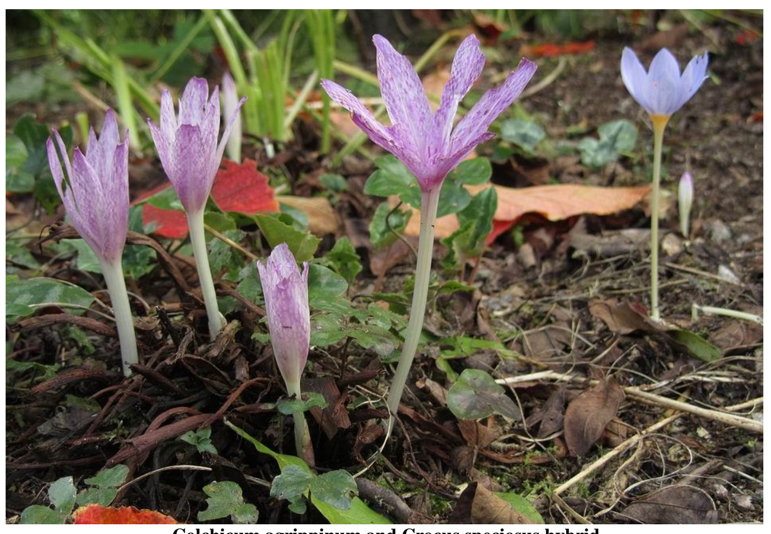
Colchicum agrippinum and Crocus speciosus hybrid