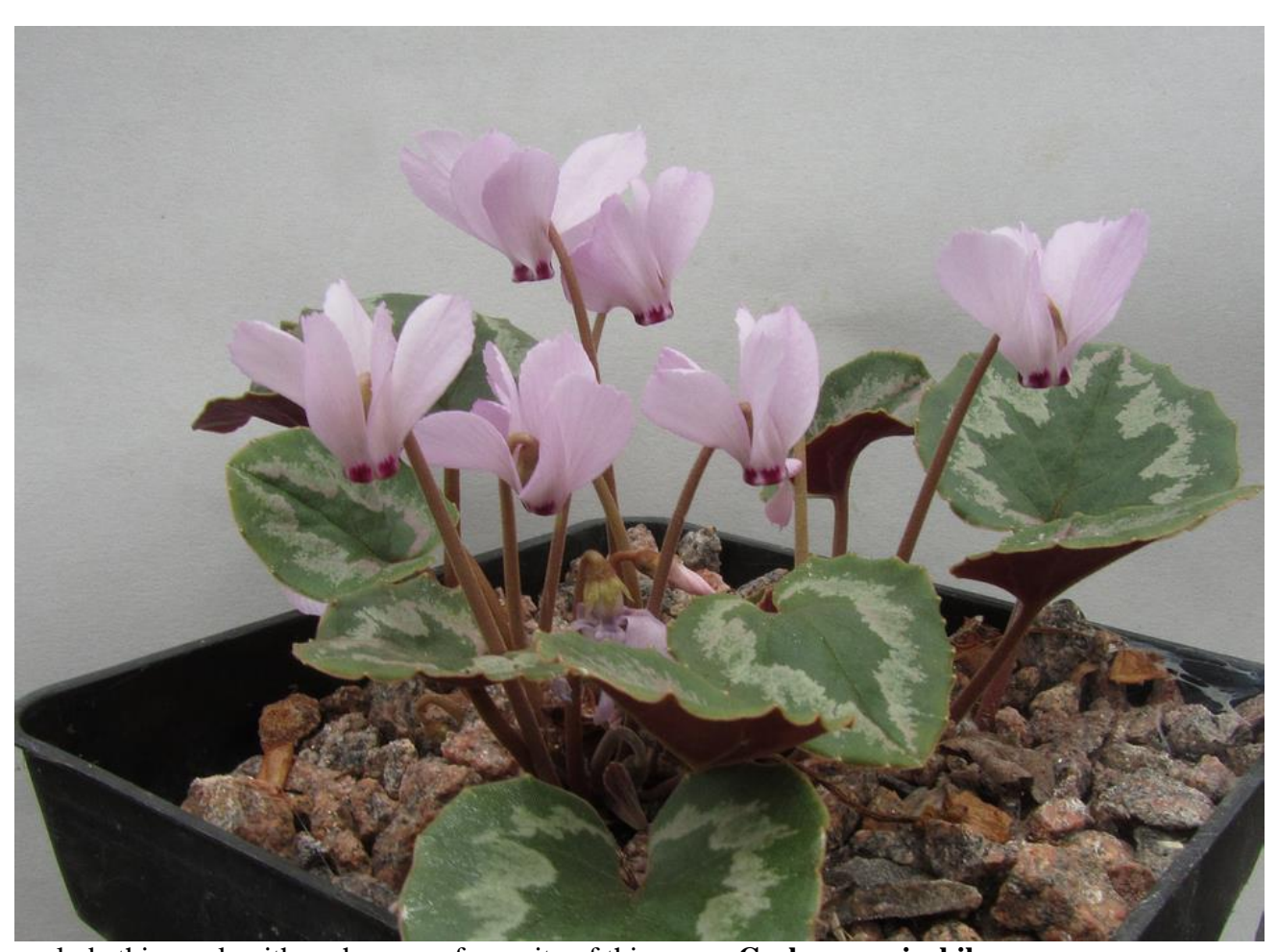
I will conclude this week with perhaps my favourite of this genus Cyclamen mirabile .....