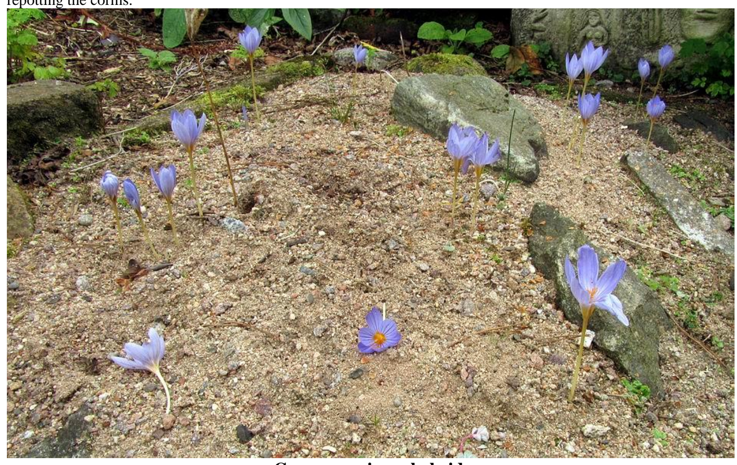
Crocus speciosus hybrids

It is these variations that I enjoy and especially when they are growing in mixed colonies – the one problem I do have is that when they do intermingle like above I have no way of sorting them out with any certainty when repotting the corms.